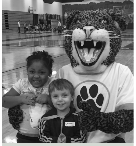
<u>4K Students Visit AHS</u> Our 4K classes had a blast exercising in the fieldhouse with their high school friends at AHS.

Ashwaubenon BLAST August 11, 2018 Ashwaubomay Park